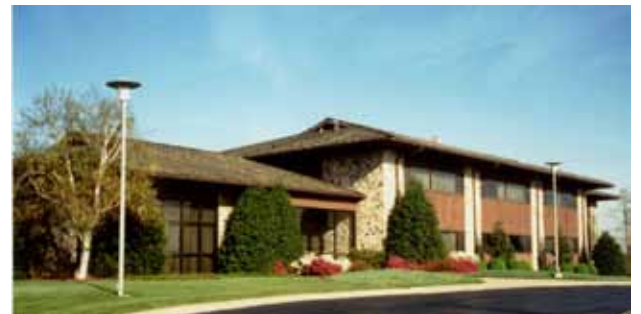
Kentucky-Tennessee Conference Office of Education 850 Conference Drive • Goodlettsville, TN 37072 615-859-1391 • www.kytn.net